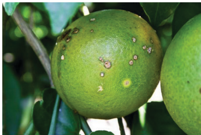
Figure 7. Young, blister-like canker lesions on fruit

Fruit Lesions. Young lesions are raised, blister-like, tan, and can be surrounded by yellow halos, depending on fruit maturity (Fig. 7). As lesions age, they become dark brown to black with brown to black sunken, corky centers, and they may have yellow halos (Fig. 8). Old lesions often have a gray appearance. Generally, the lesions are circular and vary in size. Lesions cause blemishes and early fruit drop, thereby reducing fruit yield (Fig. 9). The internal quality of the fruit is not affected.