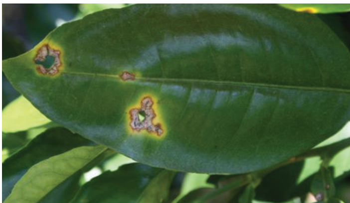
Figure 5. Old lesions of citrus canker displaying the "shot hole effect"

Stem and Twig Lesions. Stem lesions often indicate infection has been present for at least a year. They serve as a reservoir for persistent inoculum and are able to produce inoculum for up to four years. When they occur on woody tissue, they are the same color as the branch but have a raised, wart-like surface (Fig. 6a). Symptoms on twigs and fruit are similar