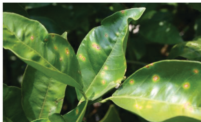
Figure 4. Young lesions of citrus canker with yellow halo